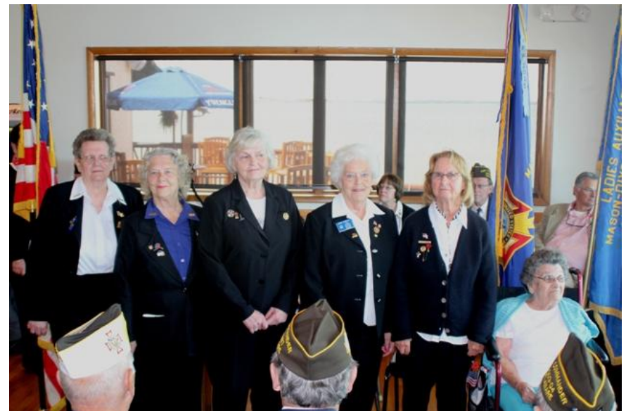
70 th Anniversary Presidents