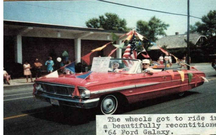
The wheels got to ride in a beautifully recontitione '64 Ford Galaxy.