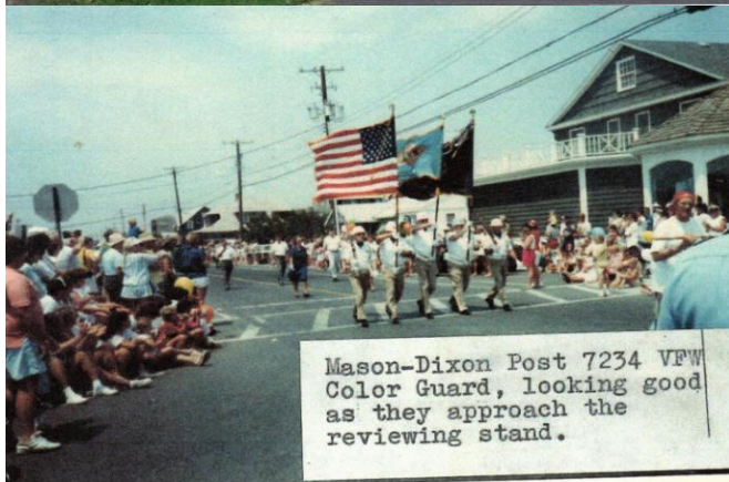
Mason-Dixon Post 7234 VFW Color Guard, looking good as they approach the reviewing stand.