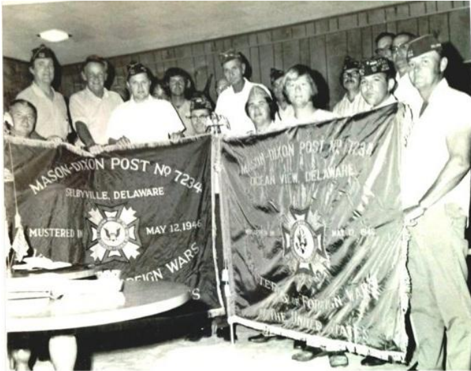
25th Anniversary of VFW7234