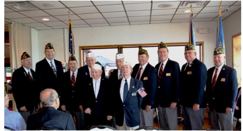
70 th Anniversary Commanders