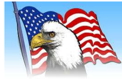
With Honor & Gratitude We Remember

Our deepest sympathy goes out to the families who have lost loved ones. Eternal rest grant unto them O’ Lord, may the perpetual light shine upon them, and may they rest in peace. Amen.